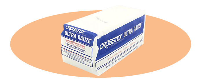
4-Ply Ultra Gauze (Crosstex)

Contains: One GUTR headband and one XL shield. Headband color is chosen randomly.