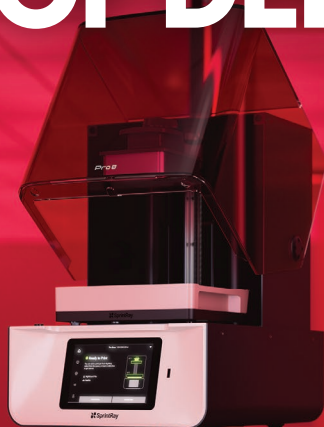
PRO55 S 3D PRINTER